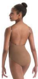
Skin Toned Leotard w/ clear adjustable straps

Check DSP COSTUME NOTES for clarity on Tights & Shoes for each costume.